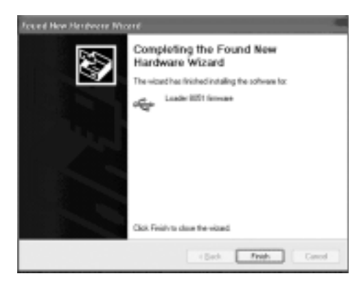
Figure 1 – Software Driver Installation Complete

At the same point during the installation, the computer will indicate that the software program being loaded is called "Loader 8051 firmware." The computer may also indicate its location as "C:\HK\MGMP3.INF" (or some other drive letter associated with the hard drive where the software files are installed) in some versions of the Windows operating system. If your computer is attempting to install a different software driver, cancel the installation and go back to the screen that will allow you to specify the location of the correct software driver. Allow the computer a few minutes to install the software driver without interruption. A dialog box, similar to the one shown in Figure 1, should appear. Click the "Finish" button to continue the installation.